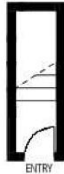
FOURTH FLOOR ENTRANCE